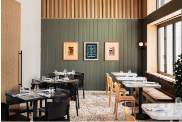
The Press Private Dining Room Up to 24 guests