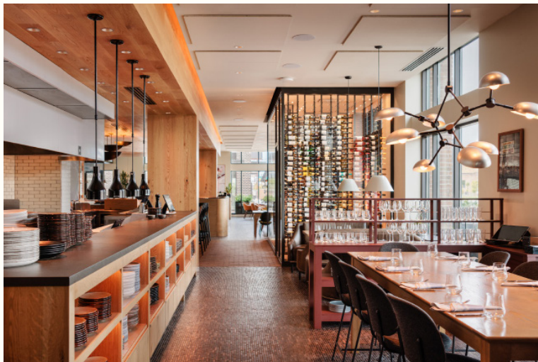
Full Buyout The Entire Restaurant

Up to 170 guests for seated dinners. Up to 200 guests for a cocktail reception.