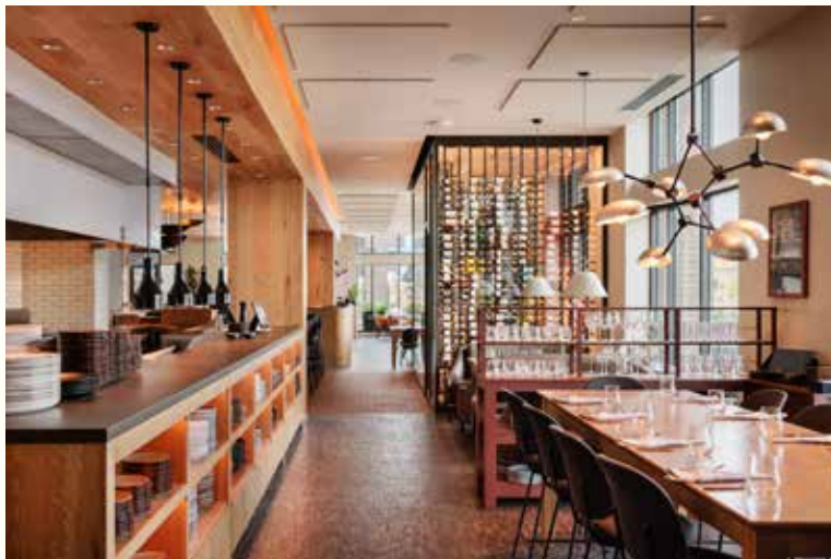
Full Buyout The Entire Restaurant Up to 170 guests for seated dinners. Up to 300 guests for a cocktail reception.