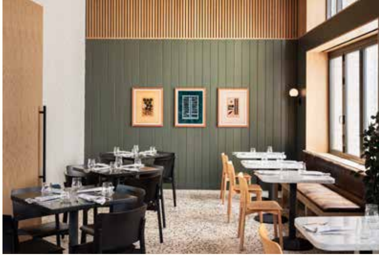
The Press Private Dining Room Up to 24 guests