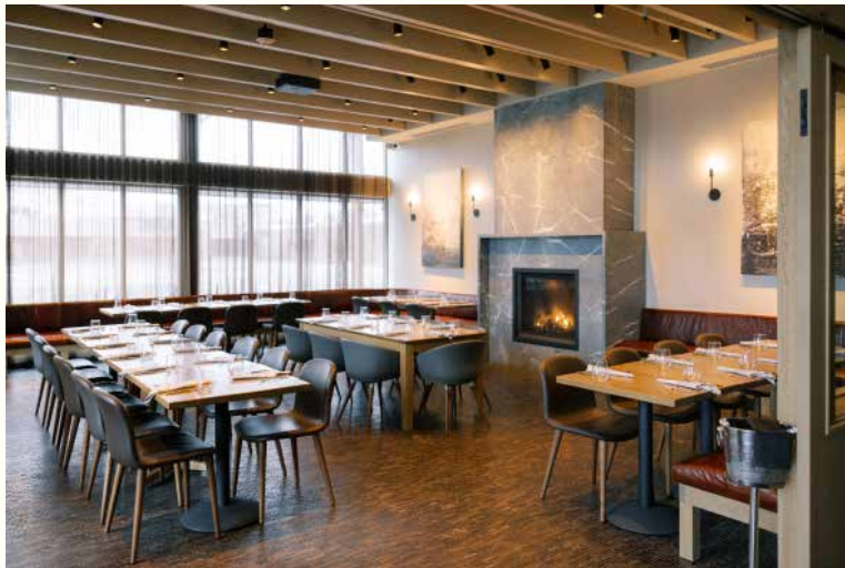
The Register Private Dining Room and Adjacent Patio Area Up to 48 guests